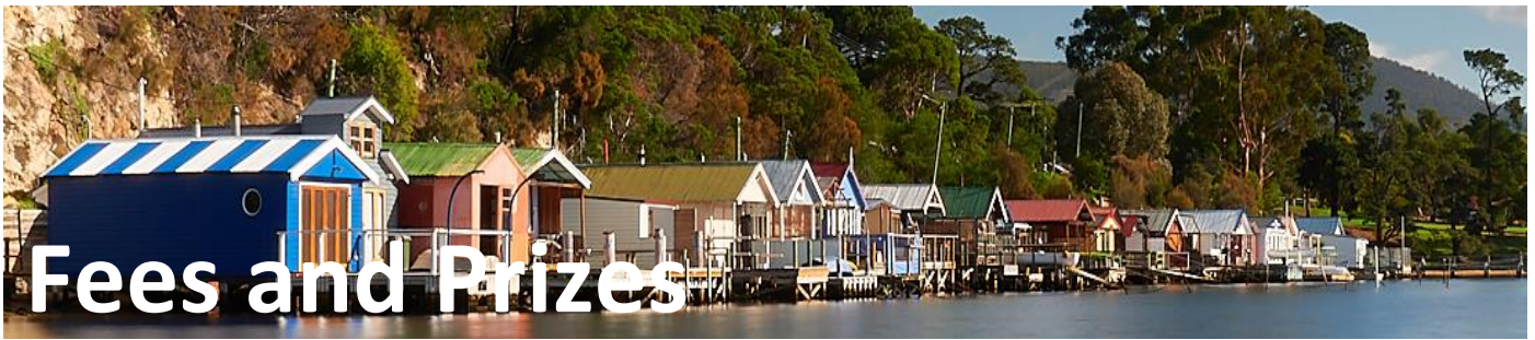
Boathouses, Cornelian Bay